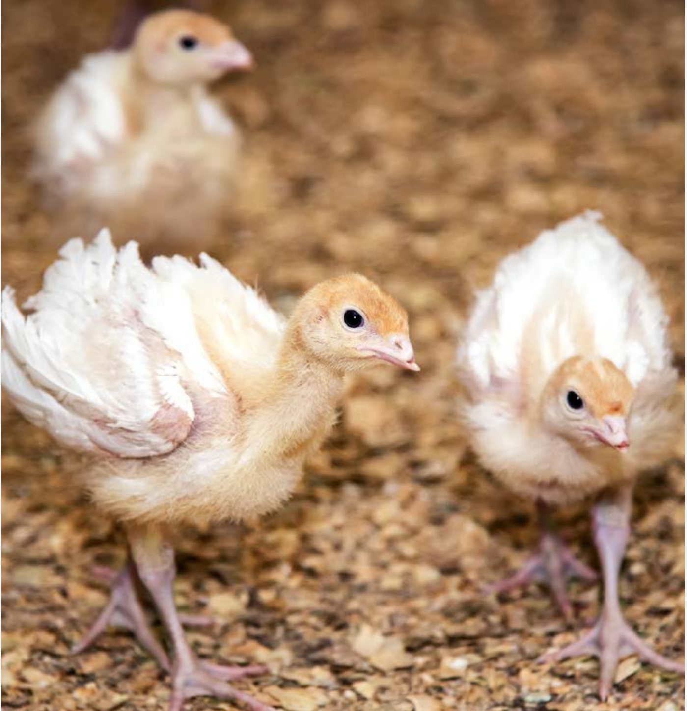
Breeding turkeys on a poultry farm in Qatar.