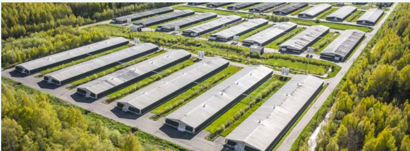
Aerial view of a poultry farm.

LITTER QUALITY, AIR QUALITY , LEG CONDITION , BREAST SKIN CONDITION , AND FOOTPAD CONDITION ARE ALL CLOSELY CONNECTED AND ARE BEST USED AND ANALYZED TOGETHER. Different production types and substrates will determine if excess moisture is more or less of a challenge.