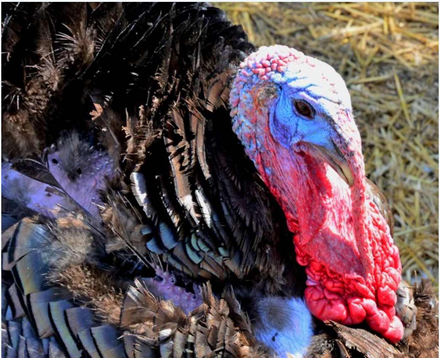
Turkey in outdoor area in France with visible feather condition issues.

However, feather condition can also be an indicator of a welfare issue in the environment (e.g., adverse pecking behavior [feather pulling], poor nest box management, or wearing due to equipment or improper handling), nutrition issue, or a health challenge.